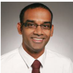
Spotlight on the