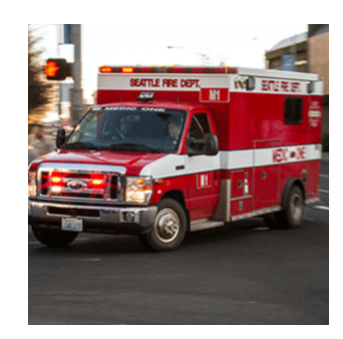
How to be Prepared for a Myasthenia Emergency