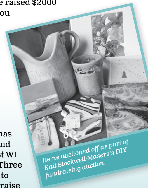
Items auctioned off as part of Kait Stockwell-Masters's DIY fundraising auction.