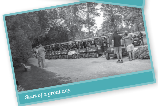
Start of a great day.